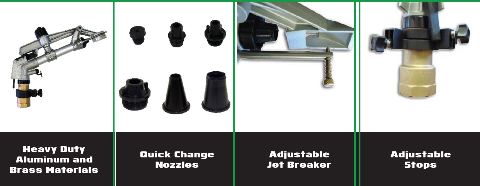
Heavy Duty Aluminum and Brass Materials